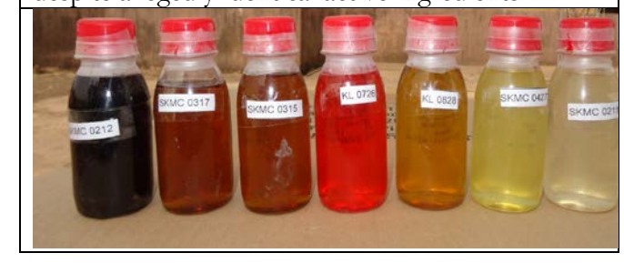
Figure 4. Glyphosate samples: diverse contents despite allegedly identical active ingredients

The potency of any given glyphosate product depends on the quantity of glyphosate acid supplied. Typically, manufacturers measure dosage in grams of glyphosate acid-equivalents (ae) per liter of formulation (g/L ae). In addition to glyphosate acid, most formulations include salts as co-formulants to improve product adherence to plant foliage. The classic original Roundup formulation included 360 g/L of glyphosate acid plus an additional 120 g/L of isopropylamine (IPA) salts. In terms of acid-equivalents, this results in a dosage of 360 g/L ae. Some suppliers advertise this same formulation as containing 480 g/L of active ingredients (glyphosate acid plus salt).